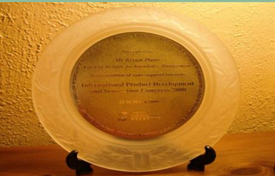
2000 Hong Kong Productivity Council,

He is an accomplished presenter and has spoken at conferences and seminar events in over 20 countries.