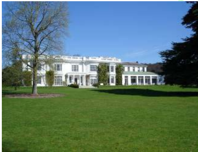
Henley Management College

http://www.henleymc.ac.uk/henleyres03.nsf/pages/kmf_yearatforum