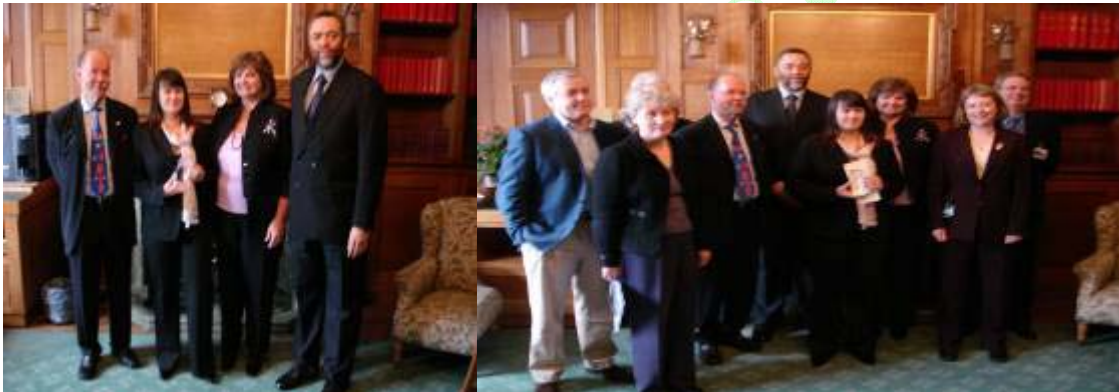
The Award Ceremony At Henley Management College

(see also http://www.entovation.com/whatsnew/KIZ Award Student 2005.ppt )